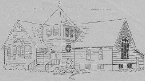
Dalmont Community PRESBYTERIAN CHURCH BOULDER, COLORADO