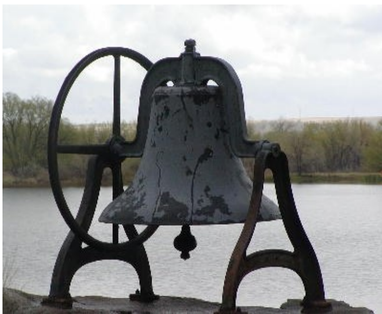
The original bell is in the court yard.

That Thou wilt guide us in all perplexities of belief and conduct, that we may hold fast that which is true, and faithfully confess Thee before men: We beseech Thee, good Lord.