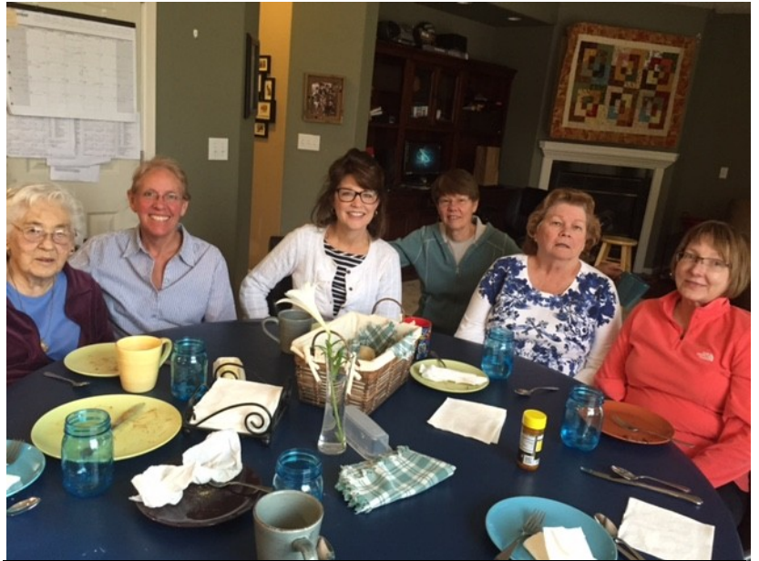
Friends lunchin' & laughin' at Cindys