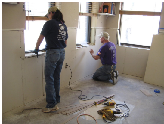
We worked at AAA Electric all week. AAA has worked with Habitat in the past wiring 24 homes.