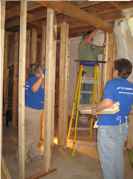
Pam's Geometric Home was one of the projects on Tuesday. Square walls were built in a round house.