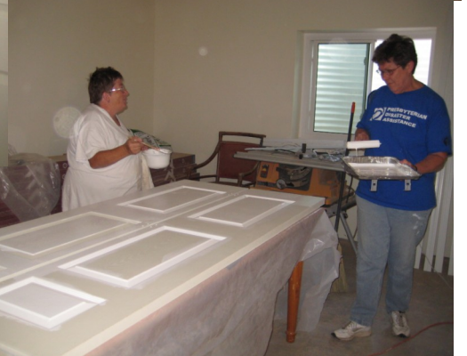
A home in Frederick was painted and doors were installed.