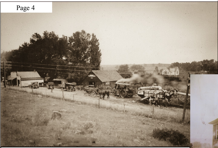
Downtown Valmont with the church in the background.