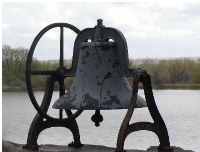
Valmont 's bell which survived the fire of 1979