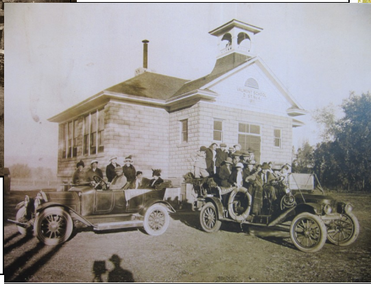
Valmont school is still standing across the street from the church's present location.