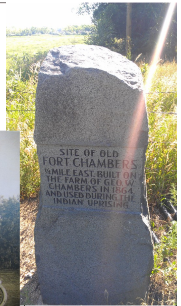
The historical marker of where Fort Chambers once stood is just down the street.