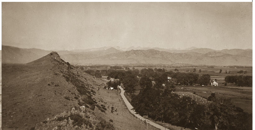
Two views from the butte of the Valmont area