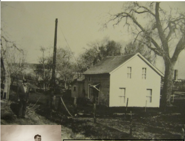
The Sawhills' original house